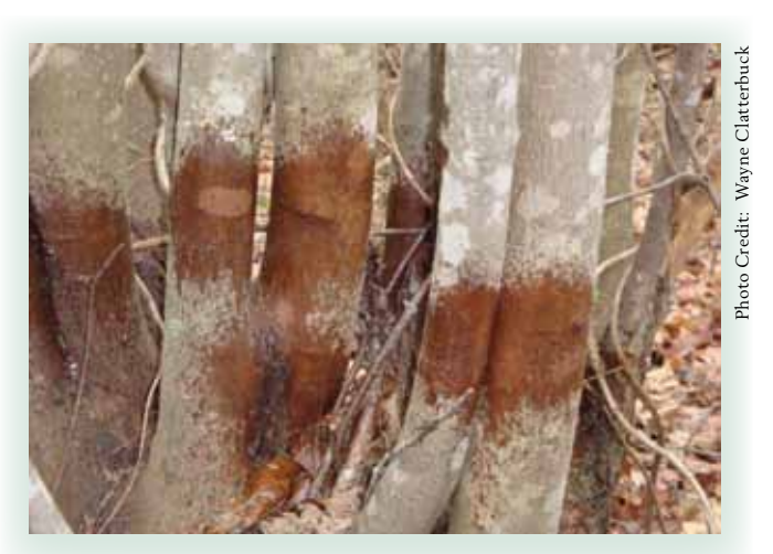
A broader band of herbicide is applied to a large red maple sprout clump.